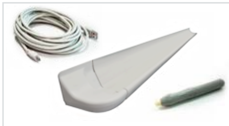
Pen Tray, Stylus Pen, 6 meter USB Cable (Included)