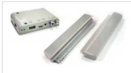
2 Speakers 20W, Amplifier, Audio Cable (Optional)